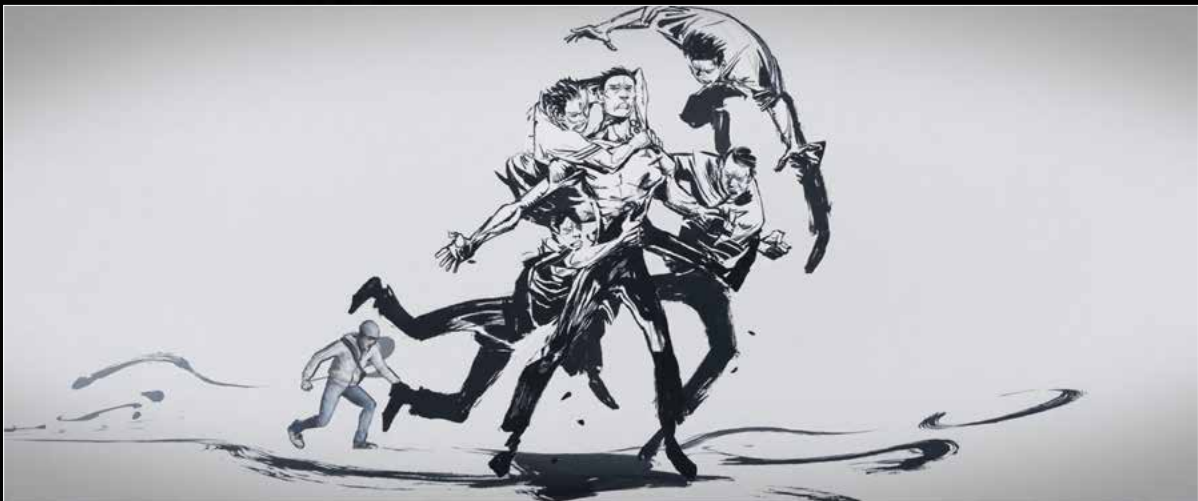
Still 5: Haunted by memories of persecution.