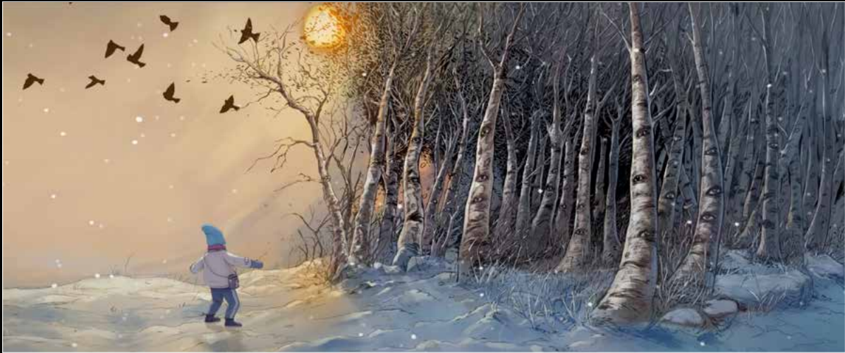
Still 4: Memories of Changchun. The birch trees have eyes.