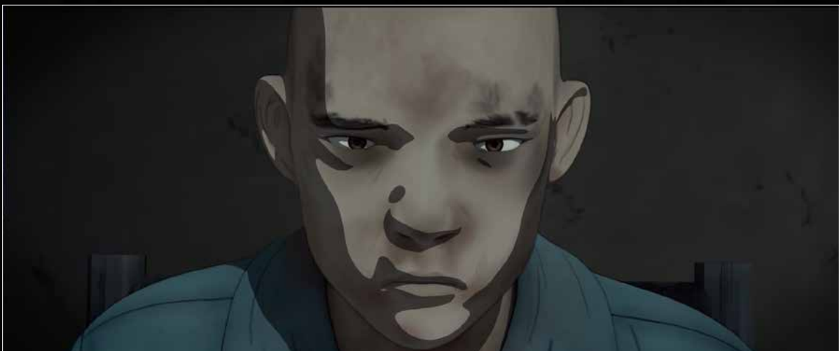
Still 9: Liang in captivity.