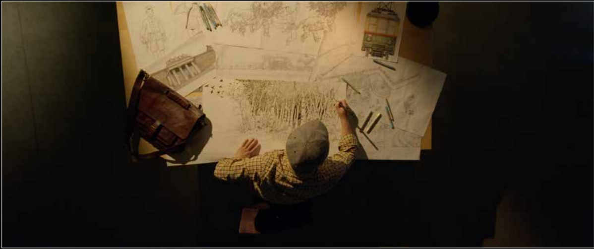
Still 1: Daxiong illustrates memories of Changchun.

High-resolution stills and film poster can be downloaded here .