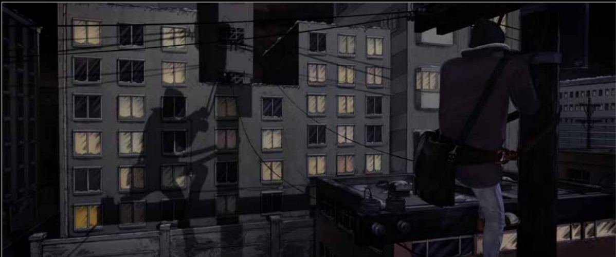
Still 2: Night of the TV hijacking.