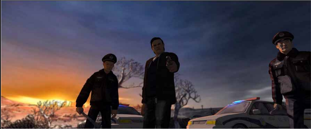
Still 7: Violent arrest.